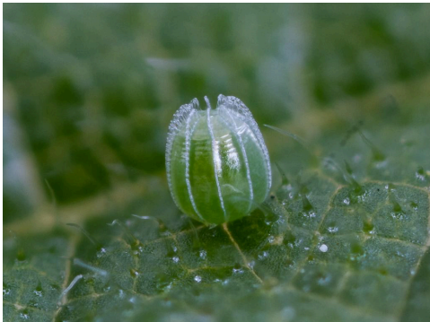
He hua o te kahukura.