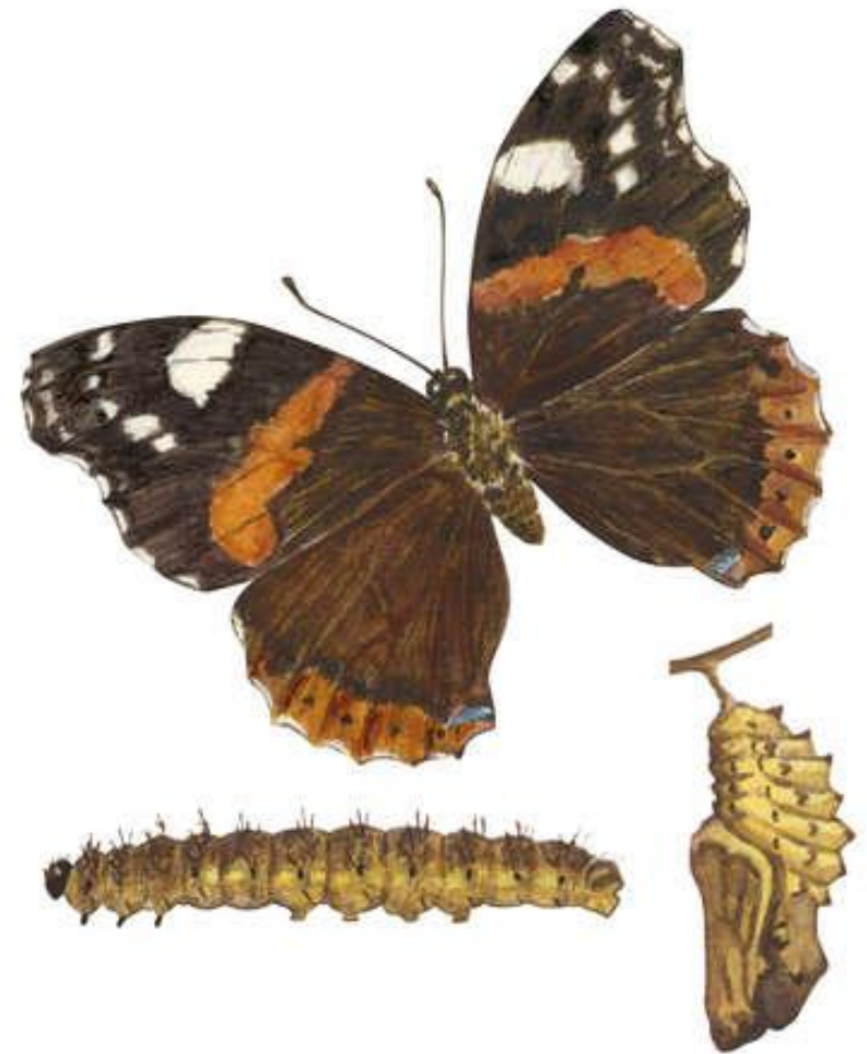
Te mataora o te kahukura. Ehara nā T.O.I ēnei pikitia