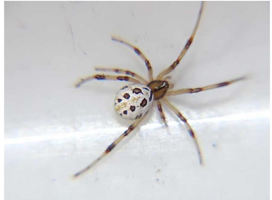
He toa katipō Ehara nā T.O.I tēnei pikitia