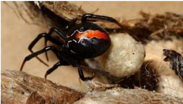
He uwaha katipō me āna hua